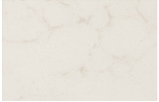
Frosty Carrina™ 5141