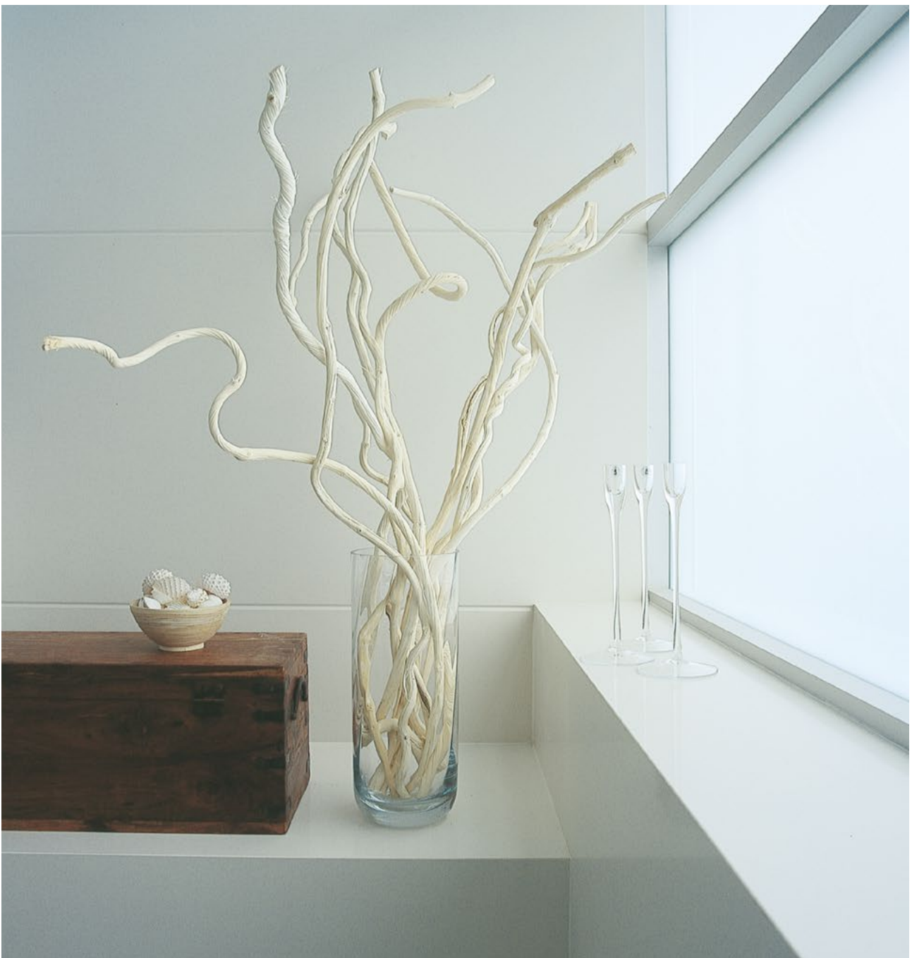
2141 Snow™ wall panels and window sill

Discover bathroom design ideas on our website and view larger samples at your nearest Caesarstone® showroom.