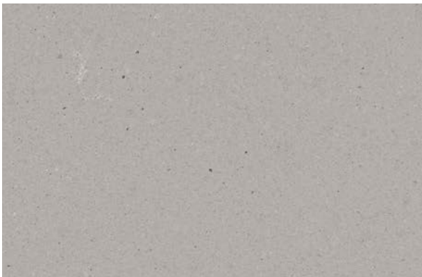
Raw Concrete™ 4004