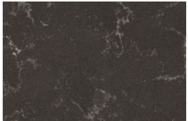
Piatra Grey™ 5003