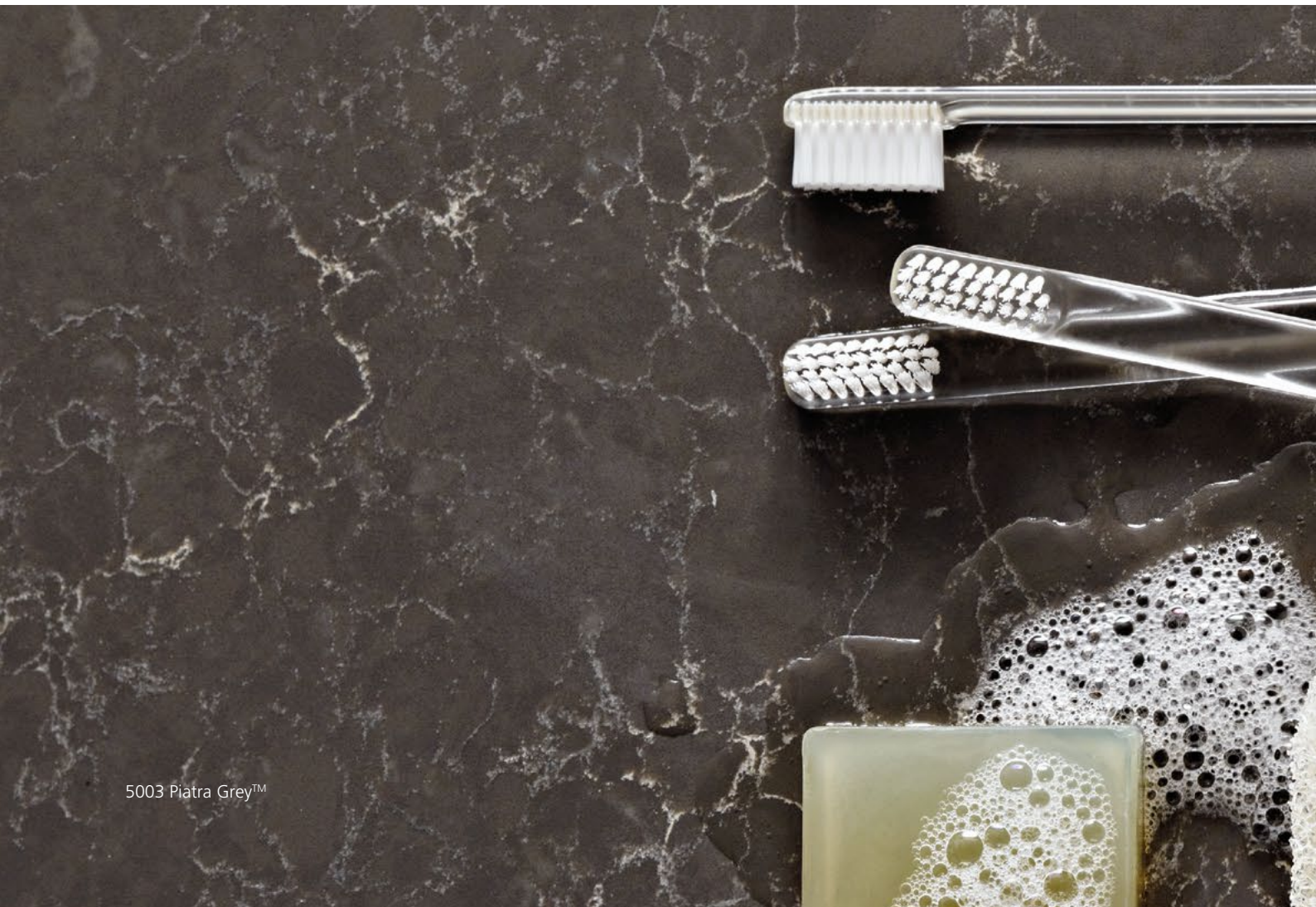
5003 Piatra Grey™