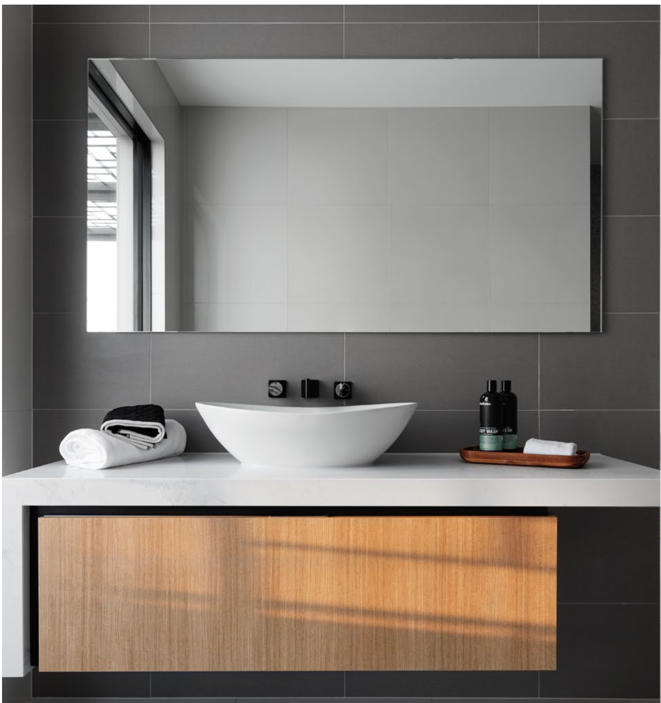
5031 Statuario Maximus™ bathroom vanity - Sentosa 52, Metricon

Our surfaces consist of up to ~90% quartz which is stronger than natural stone and one of nature's hardest minerals. They are non-porous, durable, resistant to marks, scratches, common household chemicals, mould and mildew making them ideal for wet areas. All Caesarstone® surfaces come with a 10 Year Limited Warranty*.