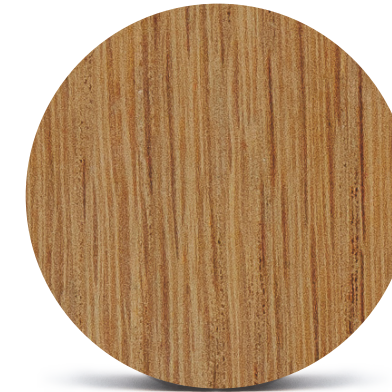
American White Oak - Oiled (OAK-OIL)