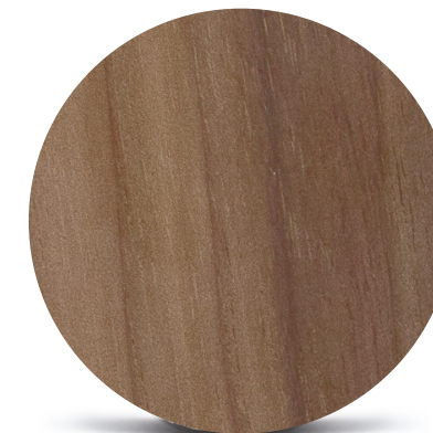
American Black Walnut - Raw (NUT-RAW)