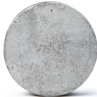
Luna Grey (LGR)

Concrete is not a homogeneous, uniform material & just like natural wood or stone, the finished concrete's appearance will always have aesthetic variations of shade, color, pattern and overall size