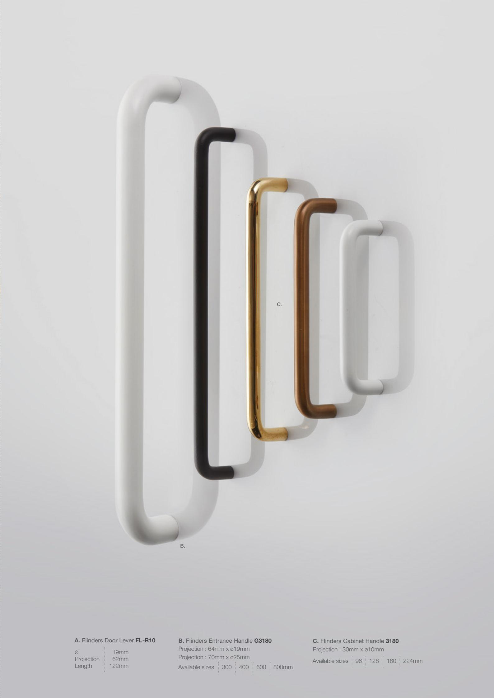
A. Flinders Door Lever FL-R10