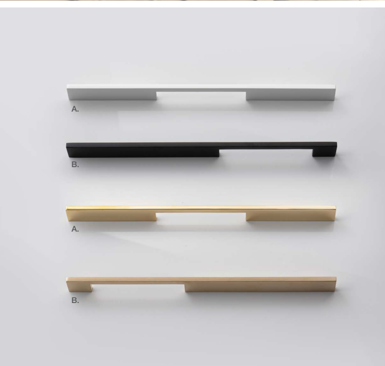
A. Blade Cabinet Pull with centre cutout 5700 6 x 25mm B. Blade Cabinet Pull with offset cutout 5701 6 x 25mm Available sizes | 168 | 272 | 368mm