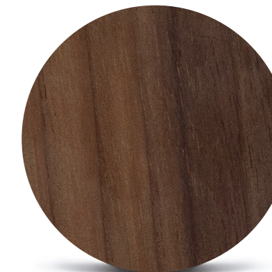
American Black Walnut - Oiled (NUT-OIL)