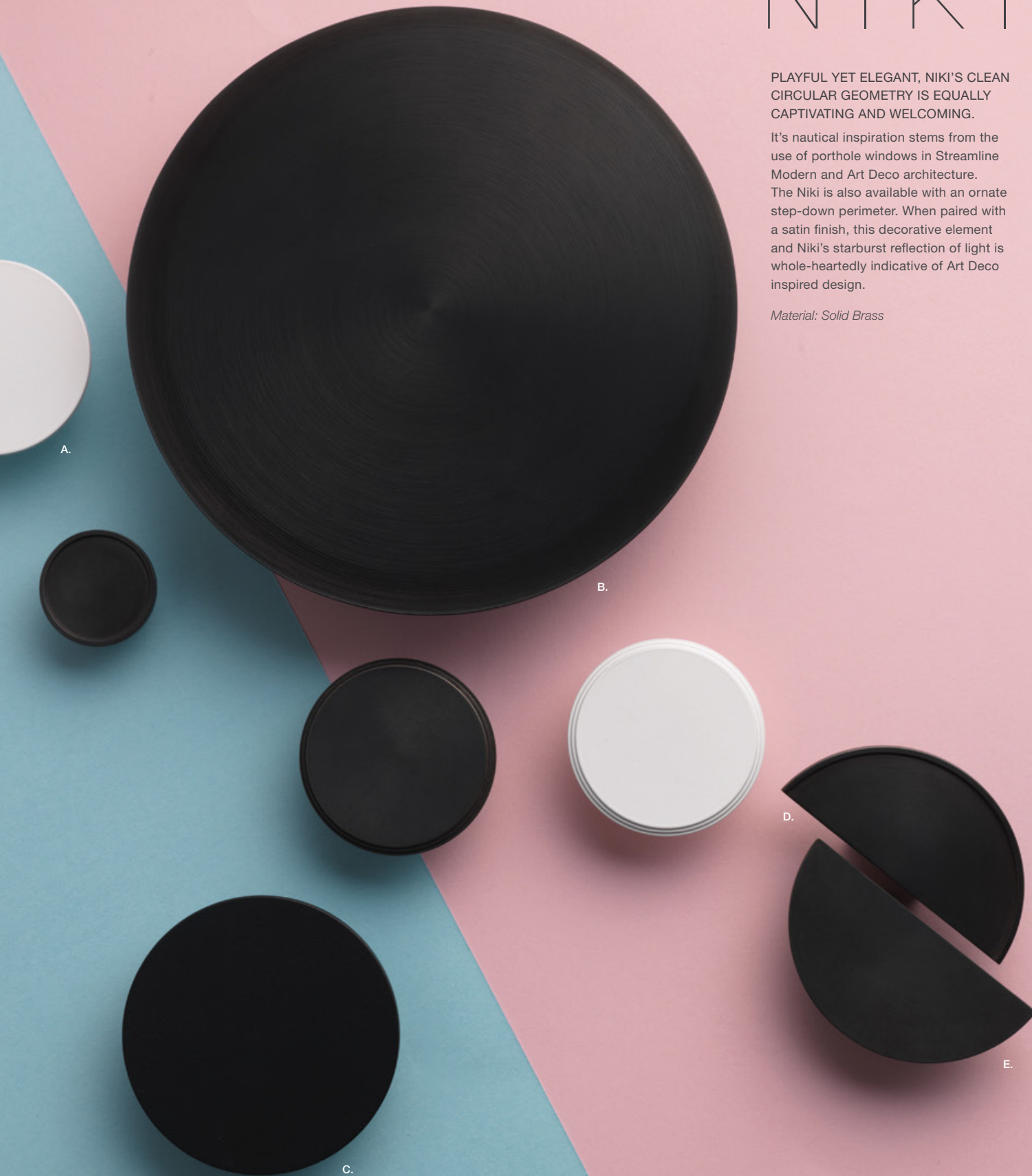
A. Niki Cabinet Knob 2820 Available sizes ø : 50-70mm