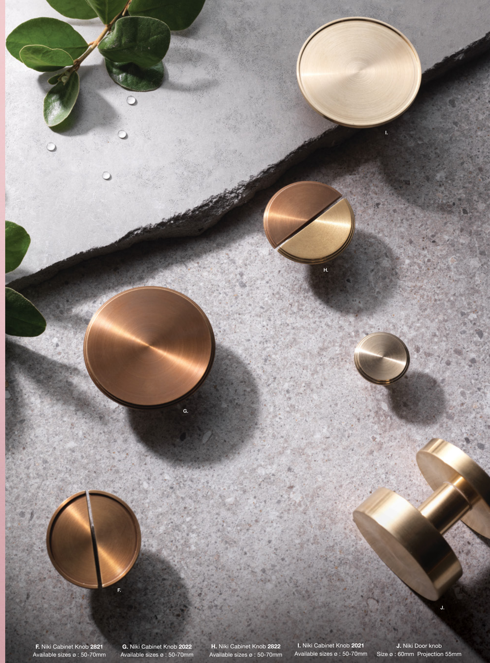
F. Niki Cabinet Knob 2821 Available sizes ø : 50-70mm